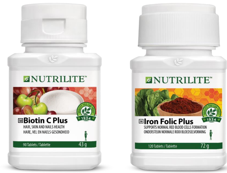
Women: Nutrilite Biotin C and Nutrilite Iron Folic Plus