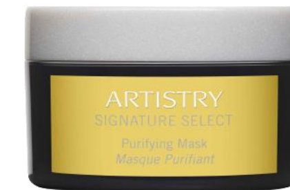
Artistry Signature Select™ Purifying Mask