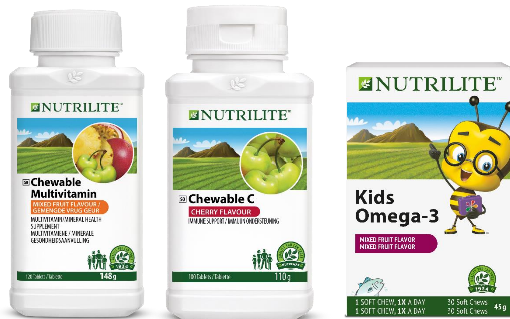
Family: Nutrilite Chewable Multivitamin Nutrilite Chewable C Nutrilite Kids Omega-3