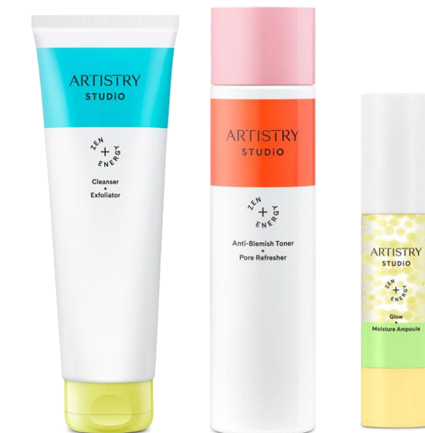
Artistry Studio™ Cleanser + Exfoliator Artistry Studio™ Rosé All Day Anti-Acne Toner + Pore Refresher Artistry Studio™ Glow + Moisture Ampoule