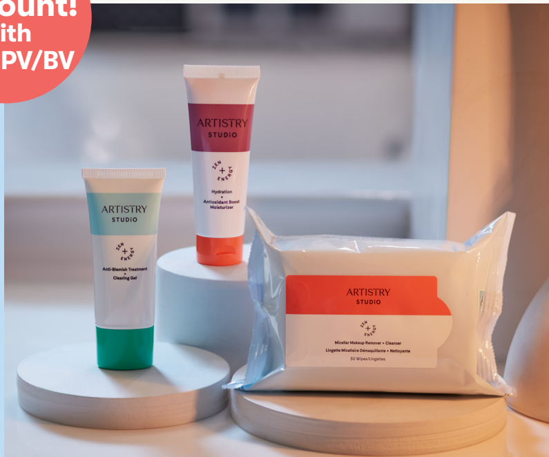
ANTI-BLEMISH TREATMENT + CLEARING GEL

ZA: a817.20 • NA: a827.84 • BW: a810.08 p31.61 b748 r1062.36